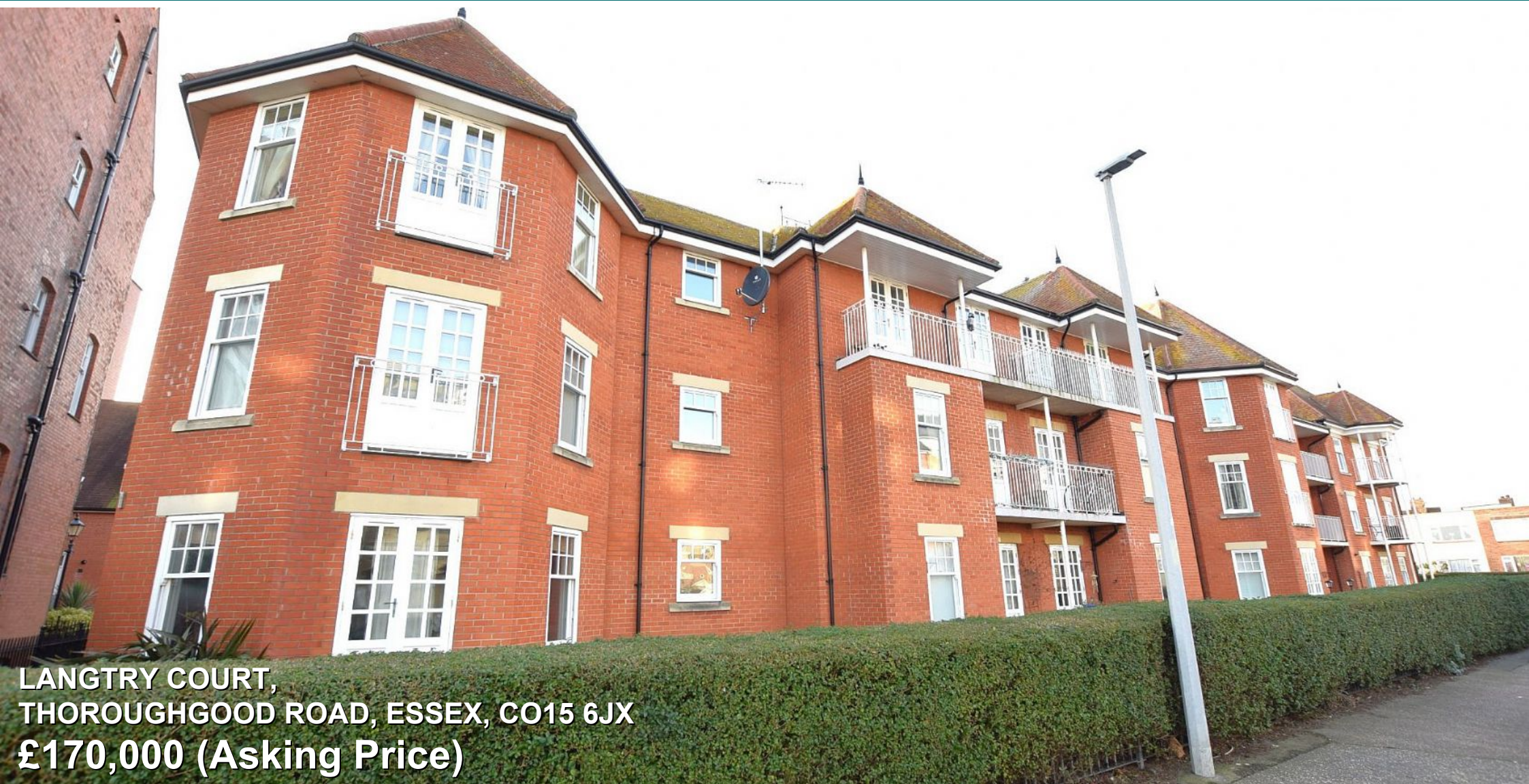
LANGTRY COURT, THOROUGHGOOD ROAD, ESSEX, CO15 6JX £170,000 (Asking Price)