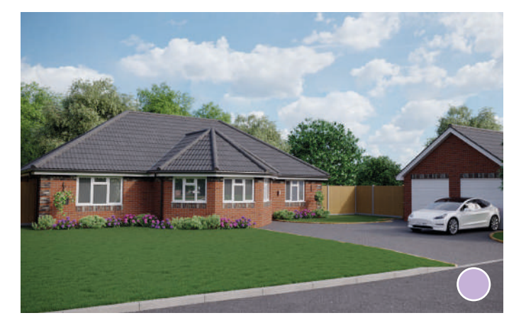
THE BUCKINGHAM 3 Bedroom Bungalow Plots 31, 32, 42 and 49