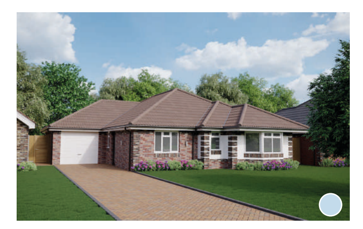
THE CHATSWORTH 3 Bedroom Bungalow Plots 33, 36, 38, 39 and 48