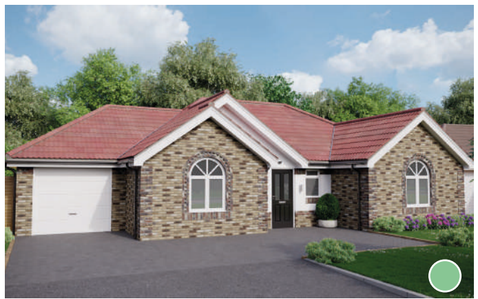
THE KENSINGTON 3 Bedroom Bungalow Plots 34, 35, 40, 41, 46 and 47