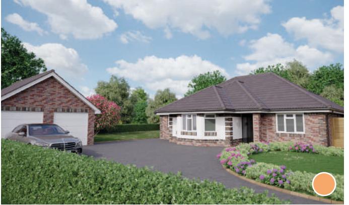
THE RICHMOND 3 Bedroom Bungalow Plots 37, 43, 44 and 45